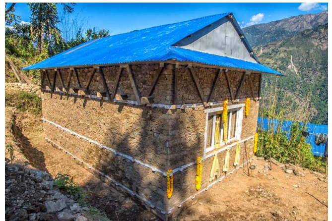
Third earthquake-resistant house rebuilt (November 2017)

In addition to its efforts to support reconstruction, ANUVAM is continuing its healthcare prevention initiatives by providing €60 to volunteer families for the construction of an outdoor kitchen fireplace , in order to avoid harmful pulmonary issues.