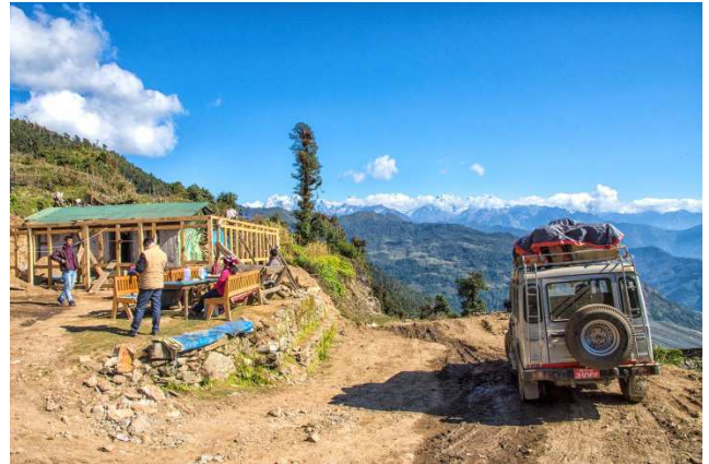
Descent towards Rapcha via the new track

The village has seen major advances in education and healthcare, with the association contributing to the construction of schools and the creation of a dispensary .