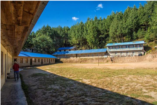
Basakhali secondary school (November 2017)

The village has seen major advances in education and healthcare, with the association contributing to the construction of schools and the creation of a dispensary .