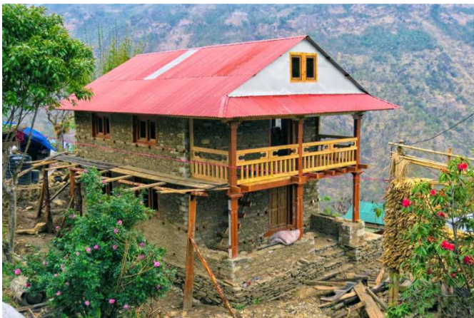
First earthquake-resistant house rebuilt (spring 2017)

In March 2018, in addition to the test house, five other earthquake-resistant houses were rebuilt in Rapcha.