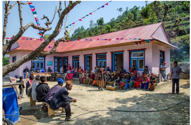
Inauguration of the dispensary (May 2013)

The association has also constructed a metal bridge over the river, helping to facilitate access to the village. There have also been cultural achievements in addition to these concrete actions, including publications on the traditions of the Khaling Rai and organising treks to help promote solidarity.