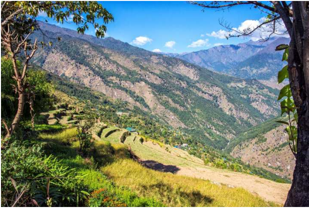
Terraced crops near Rapcha above the Dudh Khosi

Since the end of 2017, the village has been accessible via a Jeep track. Until now, the little Phaplu airport was two days' walk away, and the closest access point by road was 7 days away.