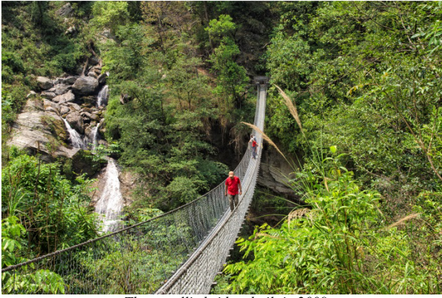
The metallic bridge, built in 2009