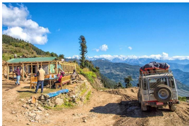
Descent to Rapcha via the new track

The village has undergone other important developments in the field of education and health, thanks to the contribution of our association, which has helped to build schools and set up a dispensary .