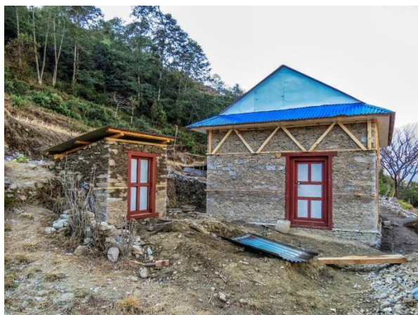
Earthquake-proof house and toilet built in January 2019

With the help of ENSAL (Ecole Nationale Supérieure d'Architecture de Lyon) and the IUT de La Rochelle (civil engineering), the association proposed rebuilding the stone and wood houses using an earthquake-resistant process that allows local materials to be used and reused. In 2017-2018, in conjunction with a technical partner CAPA (Construire et Agir par l'Architecture), a booklet with sketches was produced on this process incorporating traditional practices. Six parasitic houses have been rebuilt in Rapcha. The ANUVAM association provided financial assistance of €4,000 per house and the logistical support of a French building technician. ANUVAM is also continuing its preventive health work, providing €60 for the construction of an outdoor cooking stove for families living in the area, to prevent harmful lung problems.