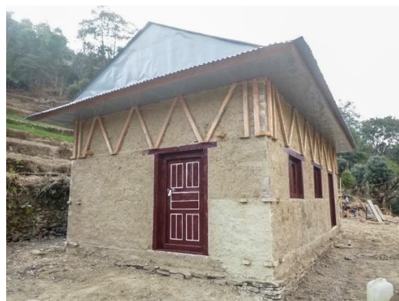
Earthquake-resistant house built in December 2020

During the winters of 2018-19, 2019-20 and 2020-21 , eight other houses were built, with the help of Nepalese master builders, for families who had previously been living in huts. ANUVAM provided financial assistance of €6,000 per house in partnership with the CDC développement solidaire ii association, which made a contribution to the final constructions.